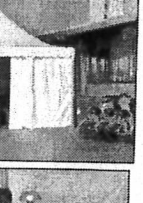
RESOLVE ACT: DUSIB has also deployed 16 rescue teams since last month to bring homeless people to its 212 permanent shelters