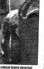
RESOLVE ACT: DUSIB has also deployed 16 rescue teams since last month to bring homeless people to its 212 permanent shelters