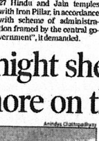
RESOLVE ACT: DUSIB has also deployed 16 rescue teams since last month to bring homeless people to its 212 permanent shelters

winter for health check-up of the homeless. DUSIB started its Winter Action Plan 2020-21 for the homeless people earlier than usual this winter and the plan will be in place till March 15, 2021. In comparison with the 60-70 pagoda tents that were being set up every year as temporary winter shelters, more than 250 shelters are coming up this winter, keeping in mind the need for social distancing due to the corona pandemic. These pagoda tents, which are fire retardant and waterproof, will have beds and mattresses, apart from other facilities. The temporary shelters are being set up at locations where homeless population concentrations are high. As the mercury started plummeting earlier in the capital this winter, DUSIB deployed its rescue teams to bring homeless people to its night shelters even before the scheduled date for the winter action plan to come in force - November 15. DUSIB has also requested people to download its Rain Basera mobile application from Google Play Store, on which they can upload photos of any area with homeless people they want to help. The 18 rescue teams of DUSIB will be bringing these homeless people to the closest shelters. A DUSIB helpline number will also remain operational 24x7 through the winter season.