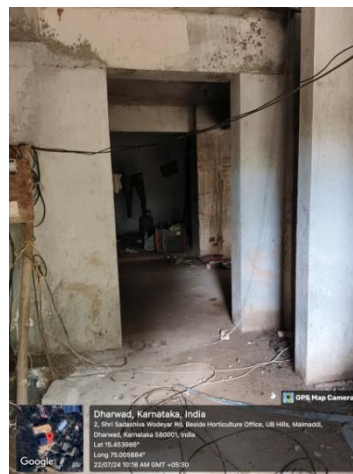
Basement in the Main Building