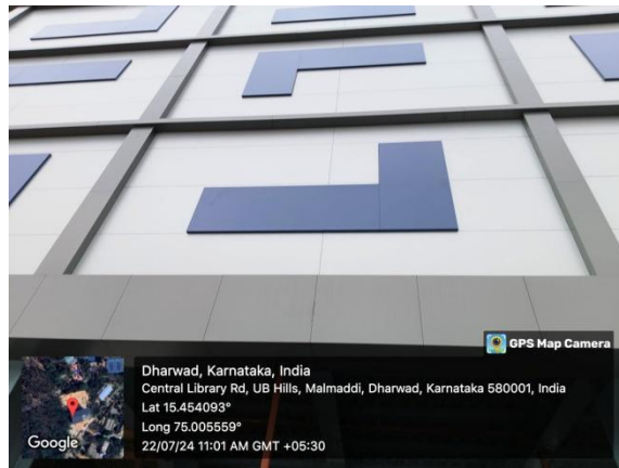
Outer Side Views of the Sports Complex