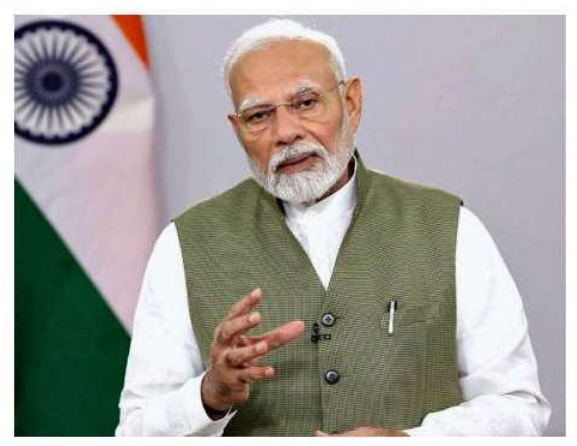
A CLEAN PITCH. Prime Minister Narendra Modi delivers video message for the first international solar festival

"To ensure an energy transition, the world must collectively discuss some important matters. The imbalance in concentration of green energy investments needs to be addressed. Manufacturing and technology need to be democratised to help developing countries,"