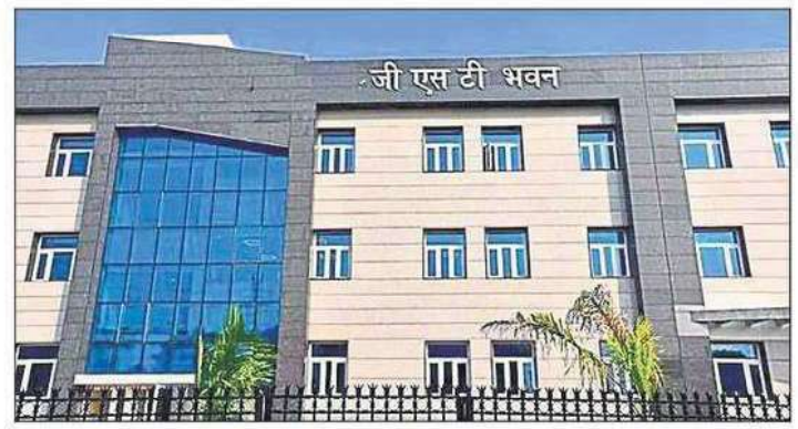
The view of the fitment committee is expected to be placed before the members of the GST Council in its 54th meeting on Monday.

The view of the committee is expected to be placed before the members of the GST Council in its 54th meeting on Monday along with scores of other clarifications and recommendations related to taxation matters, they added, requesting anonymity. Other proposals may include review of GST rates on life and medical insurance and tax relief on life-saving medicines. The fitment committee is an expert panel comprising officials from the Centre and states. It assists