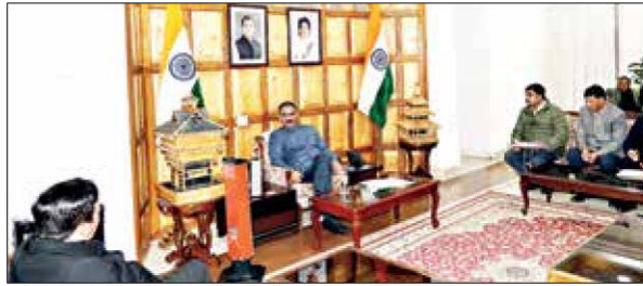
CM Sukhwinder Singh Sukhu during the meeting

Chief Minister Sukhwinder Singh Sukhu presided over the ceremony which was also co-chaired by Deputy Chief Minister Mukesh Agnihotri, who also holds the transport portfolio. Sukhu informed that as per the tender conditions approved, the company – Jio-BP – would develop the Mandi-Jogindernagar-Pathankot and Kiratpur-Manali-Keylong corridors, while EVI Technology would complete the work of