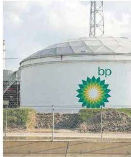
The bp board visited India in May 2013 previously.

This is the second time that the board is holding its meeting in India. The firm's board had visited India in May 2013, two years after the firm spent $7.2 billion in buying a 30% stake in 23 oil and gas blocks of Reliance Industries Ltd. Just like 2013, the BP board met oil minister Hardeep Singh Puri over dinner on Tuesday evening, flew to Gadimoga in Andhra Pradesh for a visit to the landing point of gas produced from deepsea in Krishna Godavari basin, and will meet partner Reliance Industries officials in