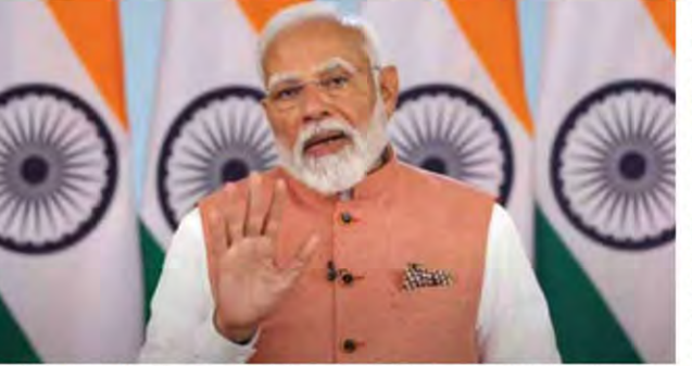
Prime Minister Narendra Modi delivers his remarks via video conferencing during inauguration of India Energy Week

For Viksit Bharat, the next two decades are very crucial, he Railways will be net zero by said, adding that in the next 2030 and we aim to achieve energy week, you are an five years we will cross many five MT annual output of from 10th largest.