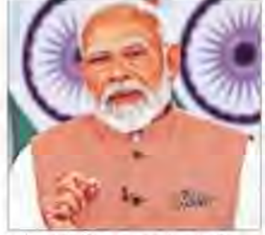
Prime Minister Narendra Modi addresses the India Energy Week conference virtually from Paris

Major discoveries and extensive expansion of gas infrastructure are contributing to the growth of the gas sector, increasing the share of natural gas in India's energy mix. The country aims to increase the share of natural gas in the energy mix to 15% by 2030, up from current 6%. "Due to several discoveries and the expanding pipeline infrastructure in India, the supply of natural gas is increasing," Modi said, adding that this will lead to a rise in the utilisation of natural gas in the near future. Modi also