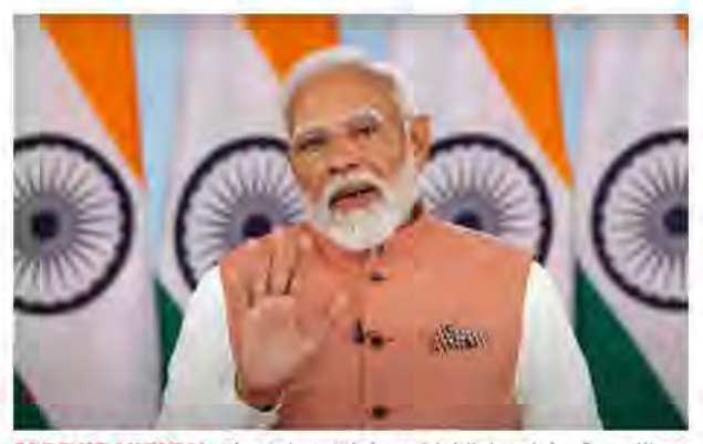
MODI'S VISION. The Prime Minister highlighted the five pillars of India's energy policy, from hydrocarbons to Al-driven grids, at the inauguration of the India Energy Week

"Over 7.6 billion tonnes of discovered upstream resources, 500 million tonnes (mt) of biofuel feedstock, and rising energy demand. At the same time, it is scaling renewables, targeting 5 mt of hy-drogen by 2030, $96 billion in hydrogen investments, and a gas share increase from 6 per cent to 15 per cent, alongside $30 billion in refining and petrochemical expansion," he added. Puri opined that the answer to energy transition lies in strategic investment across hydrocarbons