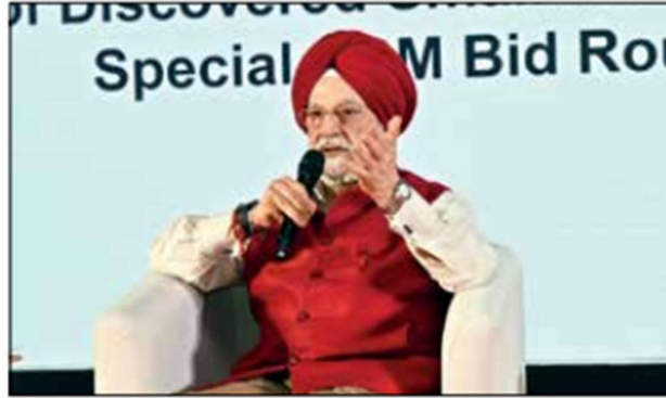
Hardeep Singh Puri addresses the OALP Round-IX on Tuesday

With India currently reliant on imports for 88 percent of its crude oil and 50 percent of its natural gas needs, the urgency