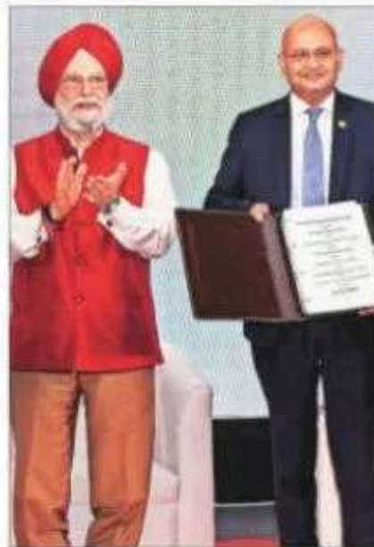
Minister Hardeep Singh Puri (left) at the ninth round of bid under OALP in New Delhi on Tuesday

OALP-IX covered 136,596 sq km across 28 blocks. The government also launched the discovered small fields bid round IV, putting on offer 55 discoveries across nine contract areas. It also launched the draft petroleum and natural gas (PNG) rules 2025, operationalising new substantive provisions introduced by the Oil fields (Regulation and Development)