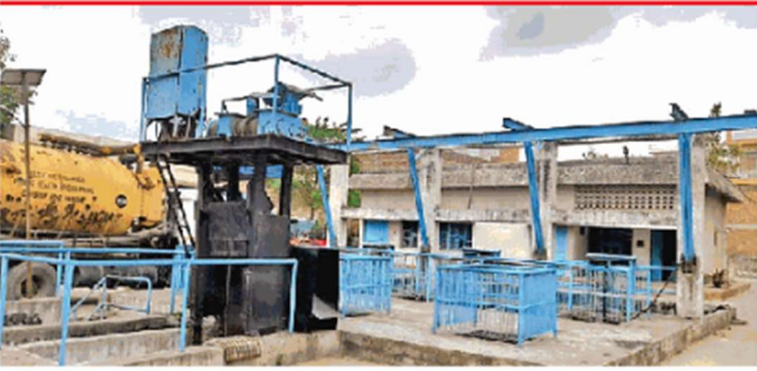
सीवरेज ट्रीटमेंट प्लांट।

● इंडियन आयल कारपोरेशन रिफाइनरी में बायलर के लिए नहर से लिया जाने वाले दो करोड़ लीटर पानी की जगह एसटीपी का ट्रीटेड पानी होगा उपलब्ध